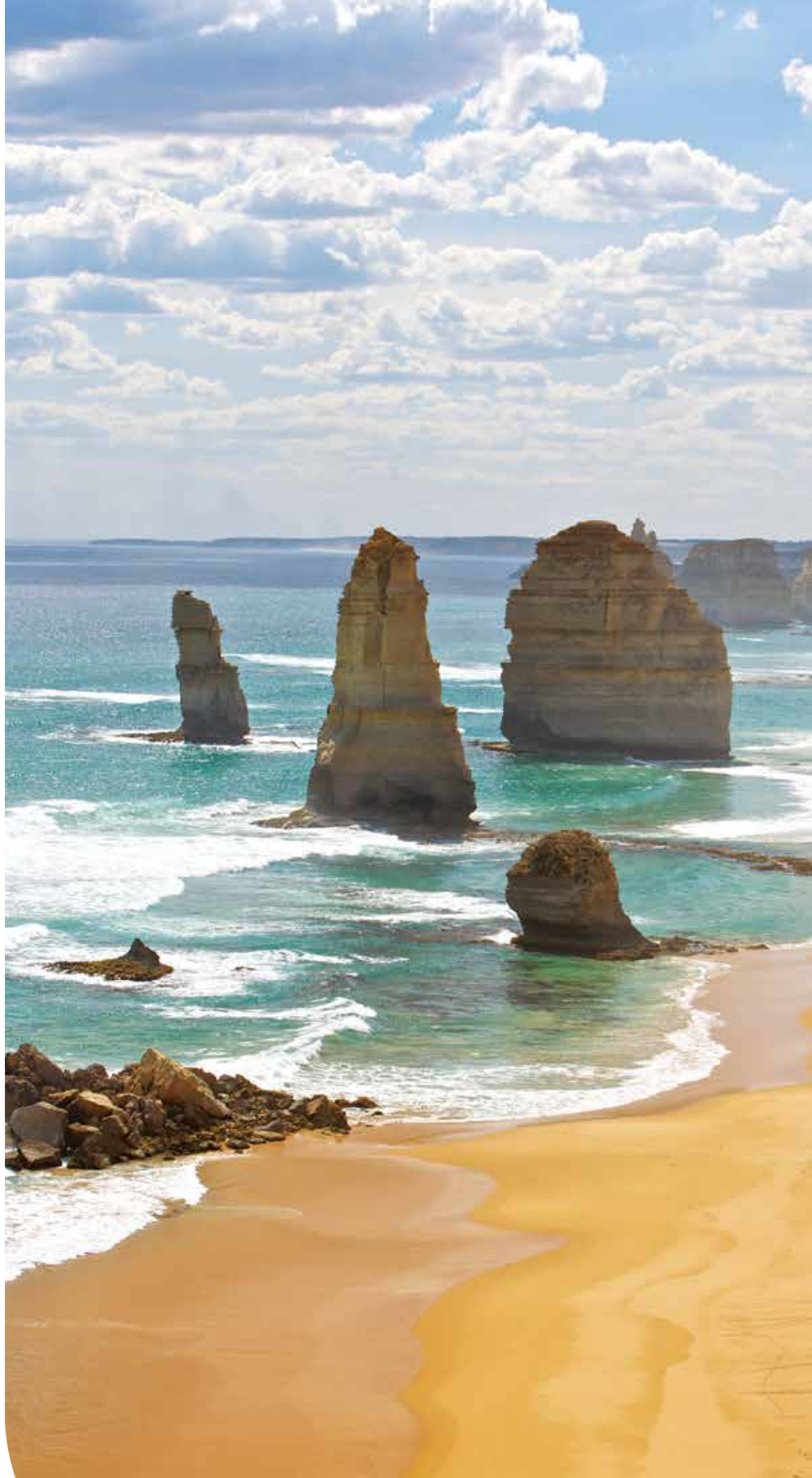
The Twelve Apostles, Great Ocean Road, Victoria, Australia