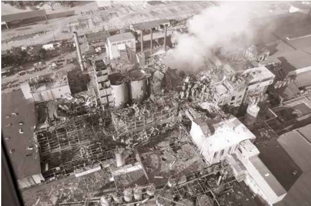
Fig. 1: The Bhopal plant during the accident

It is estimated that a total of 30 metric tons of MIC gas was emitted over a period of 45 - 60 minutes before the process could be shut down (see Figure 1). Because the gas cloud was composed of materials denser than the air, it stayed close to the ground and spread into the neighbouring Bhopal community (Eckerman, 2005). It is reported that people of smaller stature – especially children – were the worst affected by the disaster. The main cause of death was choking, with the death toll estimated at 2000 by some (Rice, 2006), and as high as 8,000 by others (Eckerman 2006). The affected area, spanning a radius of 15 kilometres, is shown in Figure 2.