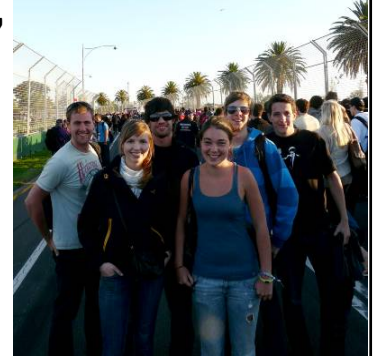
IAESTE LC Melbourne at the Australian F1 Grand Prix

We are now an officially recognised club of Swinburne University's Student Services and Amenities Association. Our membership has proved useful with access to campus facilities and financial support of the LC's pursuits. An unexpected bonus was rapid growth in the LC, spurred by an influx of new Swinburne LC members.