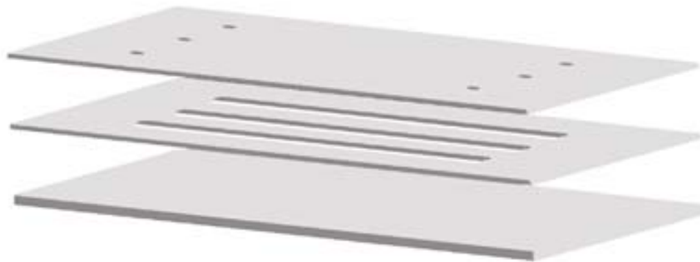
Figure 4.3 – Multichannel Connector