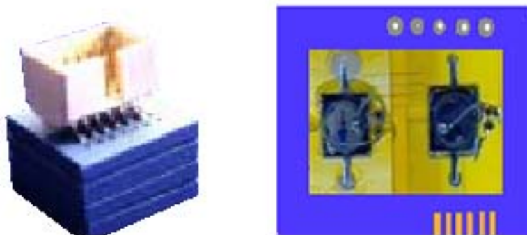
Figure 4.4 – Modular Packaging Design

To provide a modular packaging design (see Figure 4.4) we aim to find a method, such as micro-injection moulding, micro-machining, rapid prototyping and sacrificial material, to produce microfluidic channels inside a modular case. This will ensure that all channels and connectors are in the micro scale, thus reducing the fluid requirements to meet the multi-functions and complex applications.