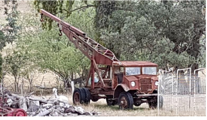
(Dorkin 2001, p. rear cover)

When you work on a table, click where you want to add a row or a column, and then click the plus sign (see also Baltz, Davies & Demain 2010, pp. 44-47). The slogan employed by opponents to highlight the flimsy evidence supporting the theory was, "Reading is easier, too, in the new Reading view" (Ahriche et al. 2019, p. 121). You can collapse parts of the document and focus on the text you want, as proven by the Commonwealth Scientific and Industrial Research Organisation (CSIRO) in 2017. If you need to stop reading before you reach the end, Word remembers where you left off - even on another device (CSIRO 2017).