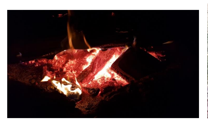
(Wave Energy Devices 2016)