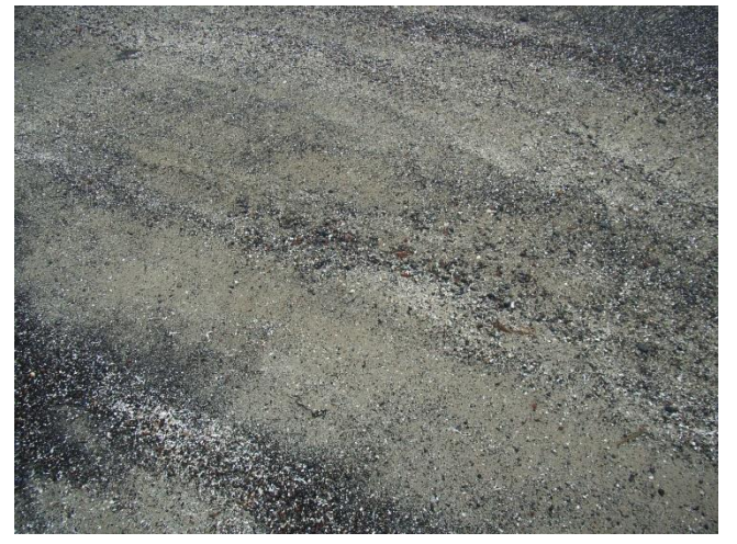
(Janssen 2012, p. 447)

Save time in Word with new buttons that show up where you need them. To change the way a picture fits in your document, click it and a button for layout options appears next to it. The picture can then end up looking like one of these: